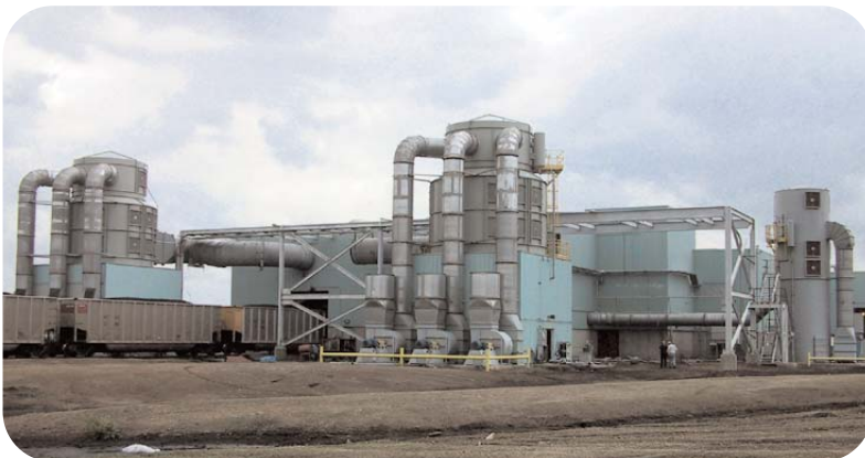
Tandem Rotary Dumper - Kansas.