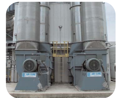
Rotary Dumper - Michigan. Air-Cure's highly successful 984RF Dust Filter is long lasting & requires minimum maintenance.