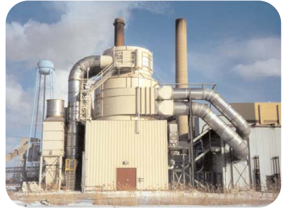
Rotary Car Dumper - North Michigan. Wintertime operation.

Air-Cure Inc. and its predecessors have specialized in dust collection systems and equipment for more than sixty years. Air-Cure continues to out-perform competitors in filtration capabilities, filter systems, project integration, quality control, and customer satisfaction making us a leader in dust control and process filtration systems.