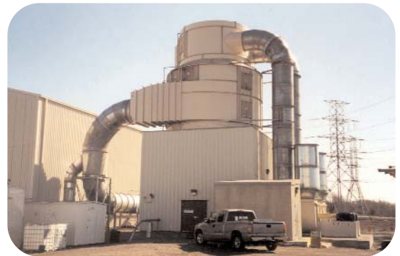
Rotary Car Dumper - South Illinois.