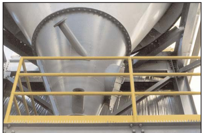
70 degree secondary hopper to improve dust discharge.

high-pressure compressor and air drier. This eliminates cold weather freeze up from moisture in the cleaning system. Secondly, the AC cleaning system provides the performance to maintain bag porosity with high moisture, ice, and fine dust, using a simple mechanism. This all equates to reliability which was a necessity for their efficient mine operation. Air-Cure engineers recommended the addition of a heated enclosure as a special feature, to eliminate ice build-up on the hopper walls. This improves flow of the collected dust and promotes initial cyclonic separation to minimize the dust load to the filter bags. It also insured consistent operation in loadout of dust to the truck during winter operation.