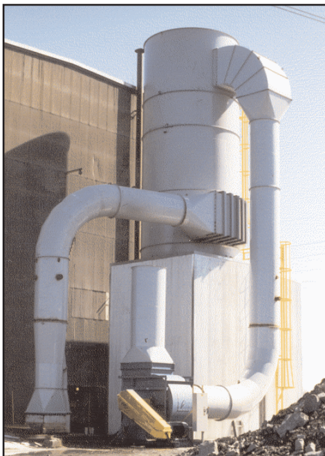
This view shows the air inlet, air outlet, and fan.

Air-Cure, Inc. supplied the dust filter, Energy and Air of Superior, Wisconsin supplied the ductwork and installed all the equipment.